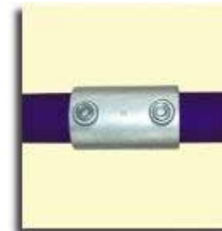
Prod Code FAST1047