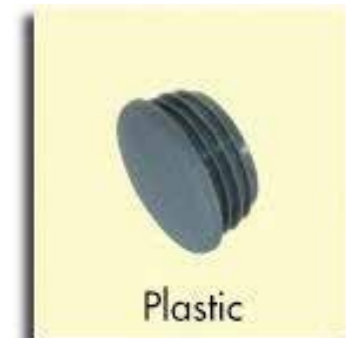
Prod Code FAST6038