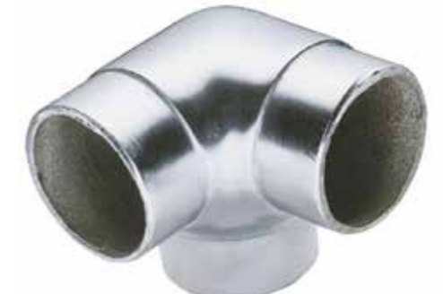
Diameter Prod Code 51mm SST51006