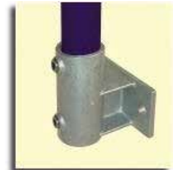
Prod Code FAST1624