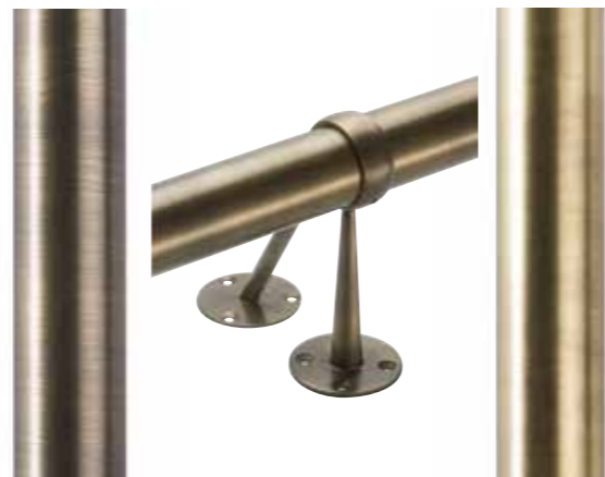
Left: Dark Antique Brass (AB) Right: Light Antique Brass (LAB)