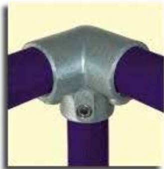
Prod Code FAST2338