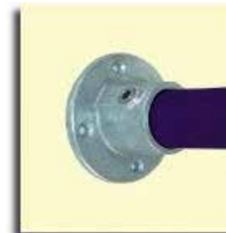
Prod Code FAST1519