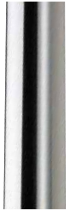
Satin Stainless Steel (SSS) Satin Nickel Plate (SN)