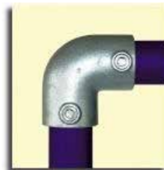
Prod Code FAST1241