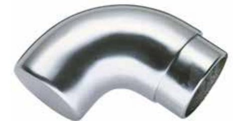
Diameter Prod Code 51mm SST51004