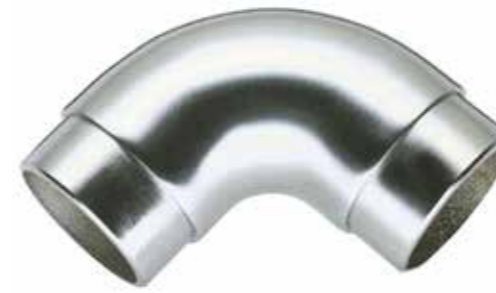
Diameter Prod Code 51mm SST51001