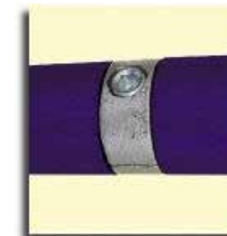
Prod Code FAST1101