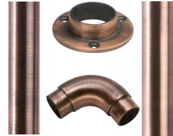
Left: Dark Antique Copper (DAC) Right: Light Antique Copper (LAC)