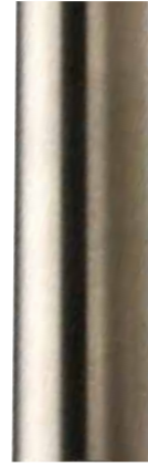
Polished Stainless Steel (PSS) Polished Chrome Plate (PC)