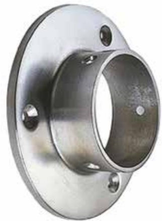
Diameter Prod Code 51mm SST51017