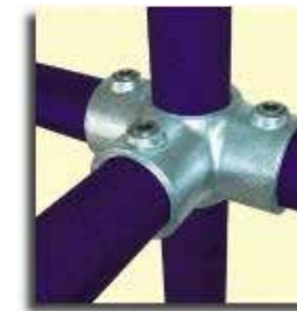
Prod Code FAST2528