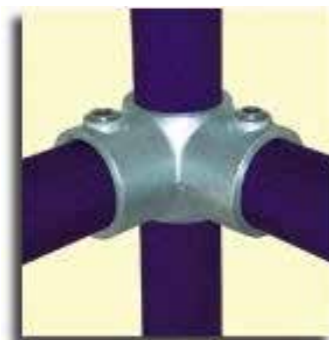
Prod Code FAST2390