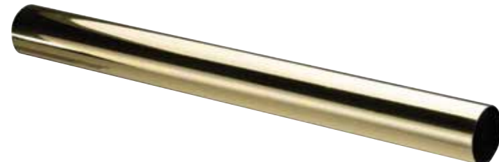
Polished Brass Plate