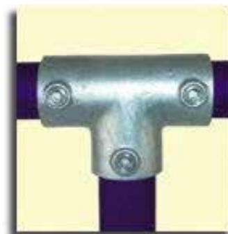
Prod Code FAST1355