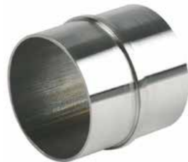
Diameter Prod Code 51mm SST51012