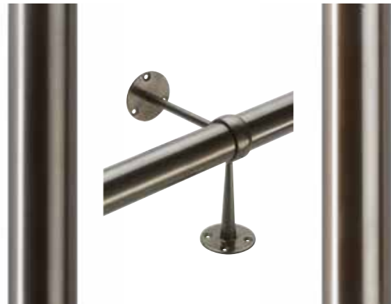
Left: Dark Antique Bronze (DAB) Right: Light Antique Bronze (LAB)