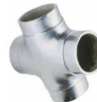
Diameter Prod Code 51mm SST51007