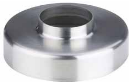
Cover for above