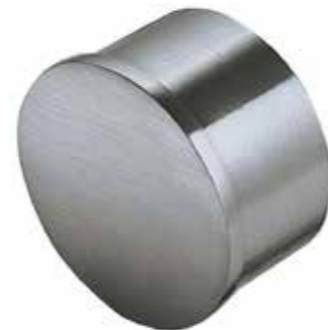
Diameter Prod Code 51mm SST51009