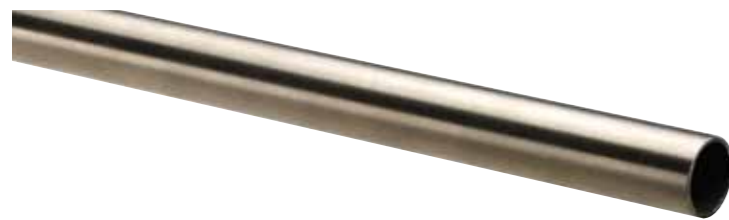
Satin Stainless Steel

This range is also available in the finishes on page 12.