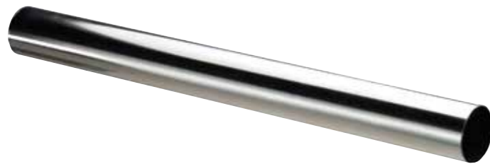
Polished Chrome Plate