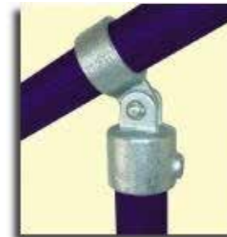
Prod Code FAST5089