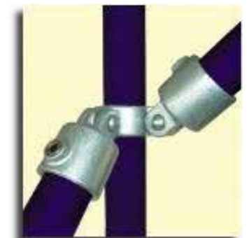
Prod Code FAST5208