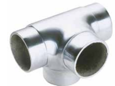
Diameter Prod Code 51mm SST51008