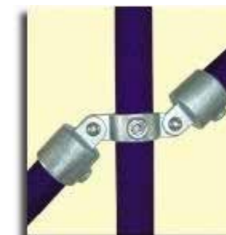
Prod Code FAST5181