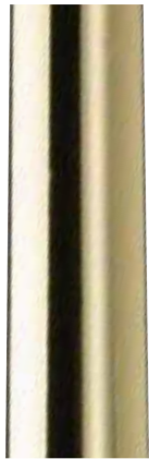
Solid Polished Brass (PB) Brass Plated Steel (EB)

The tube and accessories on pages 6-11 are available in the finishes below.