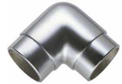
Diameter Prod Code 51mm SST51002