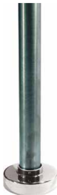
Satin Stainless Steel