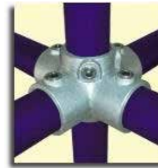
Prod Code FAST3007