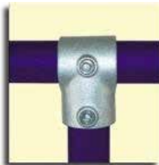
Prod Code FAST1295