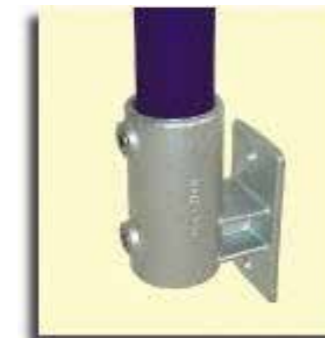
Prod Code FAST1601