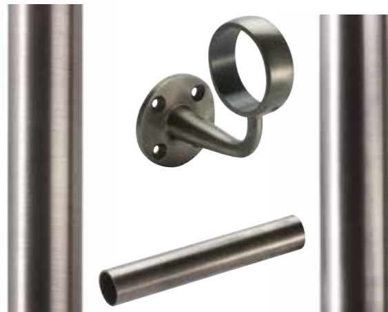
Left: Dark Antique Nickel (DAN) Right: Light Antique Nickel (LAN)