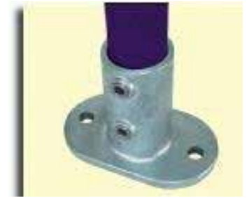
Prod Code FAST1562