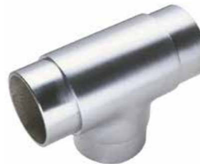
Diameter Prod Code 51mm SST51005