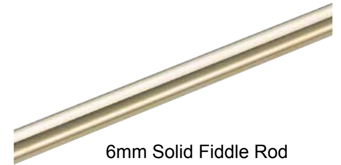
6mm Solid Fiddle Rod